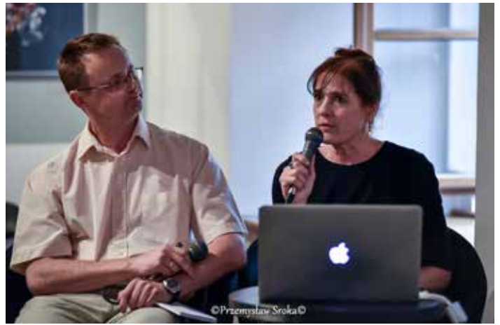
Tarnow, Poland 2015