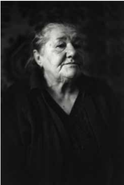
Above: Genia, Ukraine, 2005 Silver Gelatin Print