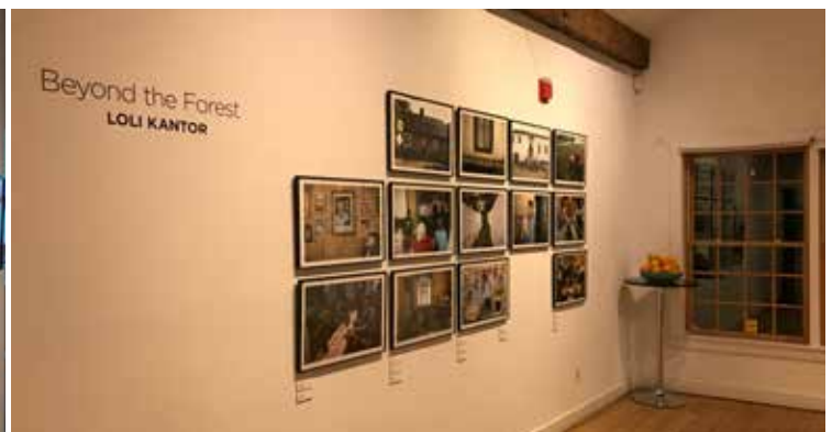
Griffin Museum of Photography, Winchester, MA 2017