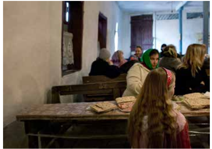
Women of Bershad, Ukraine 2008