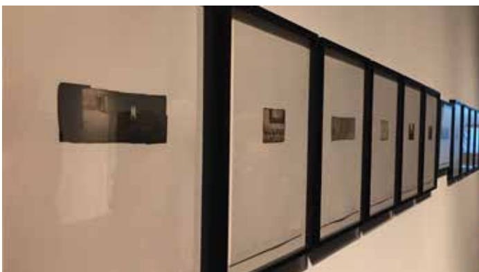
Contemporary Jewish Museum, San Francisco, CA 2016-2017

Palladium Prints: single image size 5.99x9.01 cm (2.36x3.54 inches) on 27.94x38.1 cm (11x15 inches) Rising Artist Dawing Bristol 2-ply velum paper (up to 30).